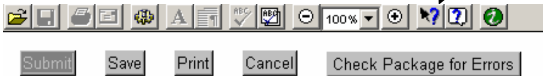
Figure 2: Grants.gov Application PureEdge Toolbar

Click on “Help Mode” (see arrow in Figure 2 below) in the PureEdge tool bar and scroll over the blocks for tips on navigating through the forms in this application package.